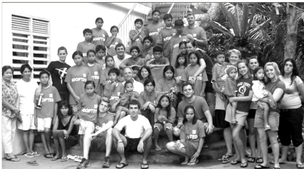
The two week team, visiting Uncle Dick's Home in Surallah, Mindanao of the Philippines